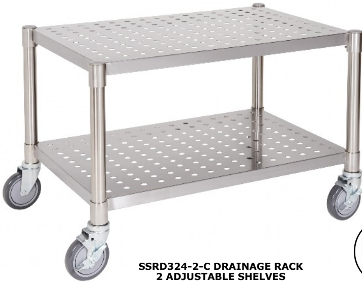
SSRD324-2-C DRAINAGE RACK 2 ADJUSTABLE SHELVES