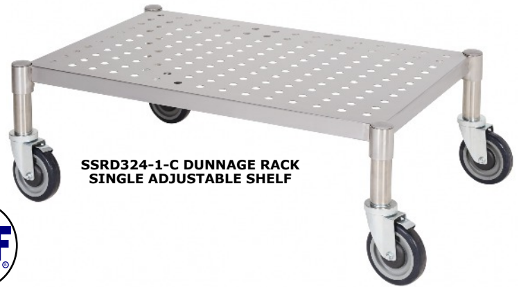
SSRD324-1-C DUNNAGE RACK SINGLE ADJUSTABLE SHELF

Heavy duty quality, robust construction, good aesthetic style, safety finish is easy to maintain and keep clean. Suitable for any harsh hard working environment where high standard of hygiene is essential.