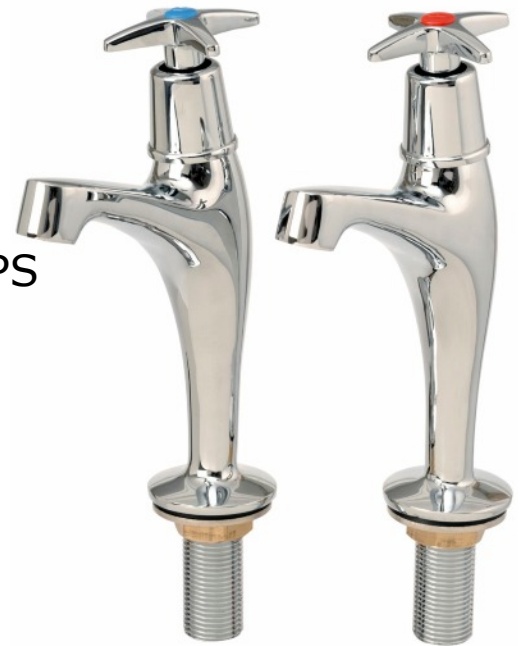
SPTC 1/2" PILLAR TAP CROSS HEAD

Heavy duty chrome on brass, robust construction, good aesthetic style, safety finish is easy to maintain and keep clean. Suitable for any harsh hard working environment where high standard of hygiene is essential.