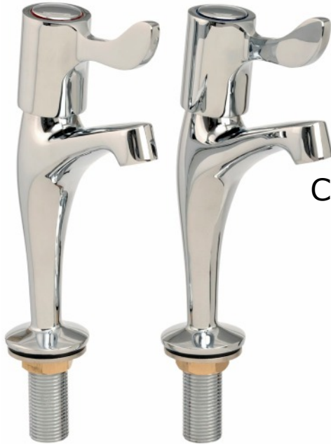
SPTL 1/2" PILLAR TAP LEVER HANDLE

PILLAR TAPS - cross head or lever handle - heavy chrome