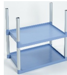
FOUR UPRIGHT CORNER POSTS ON SHELF SOCKETS DO NOT USE MALLET DIRECTLY ON CORNER POSTS