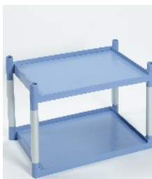
MIDDLE SHELF INTO FOUR CORNER POSTS NOTE POSITION OF SHELF UPSTANDS BEFORE FIXING