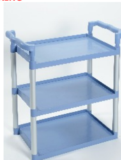
HANDLES OVER TOP SHELF SOCKETS