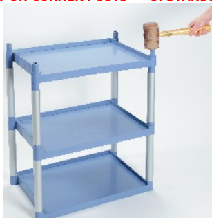
TAP TOP SHELF GENTLY SO SOCKETS ARE INSERTED INTO POSTS