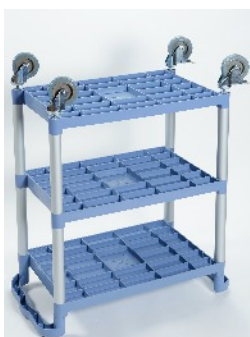
CASTORS INTO BOTTOM SHELF SOCKETS PLAIN CASTORS ONE END BRAKED CASTORS OPPOSITE END