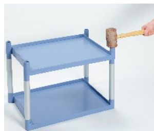
TAP MIDDLE SHELF GENTLY SO SOCKETS ARE INSERTED INTO POSTS