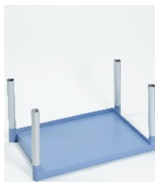
FOUR CORNER POSTS ON SHELF SOCKETS DO NOT USE MALLET DIRECTLY ON CORNER POSTS