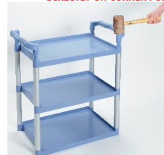
TAP HANDLES GENTLY ONTO TOP SHELF SOCKETS