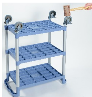
TAP CASTORS GENTLY INTO BOTTOM SHELF SOCKETS