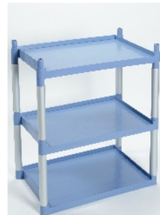
TOP SHELF INTO FOUR CORNER POSTS NOTE POSITION OF SHELF UPSTANDS BEFORE FIXING