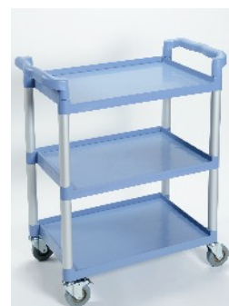
TURN COMPLETED TROLLEY CORRECT WAY UP READY FOR USE