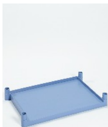
BOTTOM SHELF ON FLAT SURFACE RIGHT WAY UP