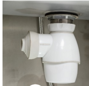
Fit waste outlet to basin and screw bottle trap to waste outlet