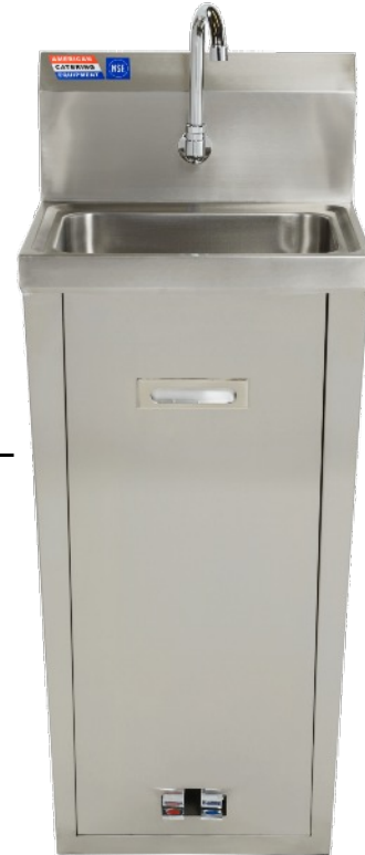
Slot cabinet front into place