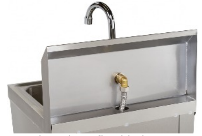
Tighten long flexible hose to brass elbow at rear of tap