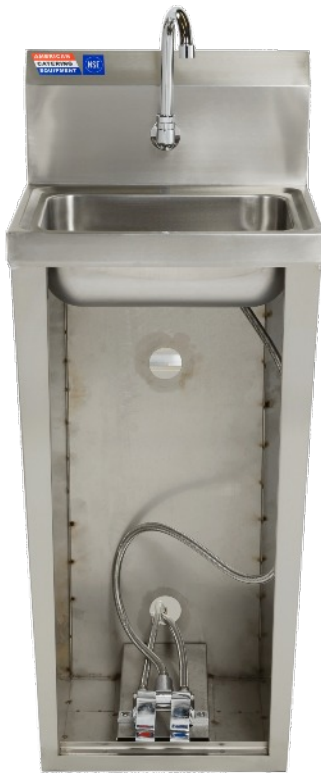
Connect plumbing as required