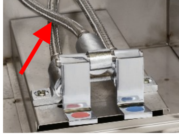
Tighten long flexible hose in to foot pedal