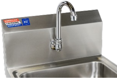
Fit goose neck faucet to tap base