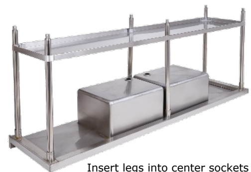
Insert legs into center sockets