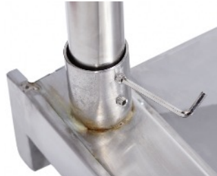
Tighten set screws (2 per leg) securing underframe to sink top DO NOT OVER TIGHTEN