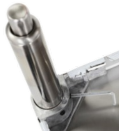
Tighten set screws (2 per corner) to secure shelf DO NOT OVER TIGHTEN