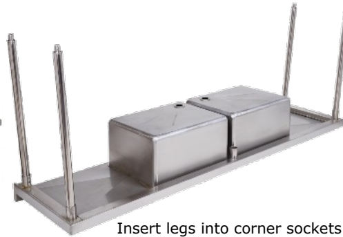
Insert legs into corner sockets