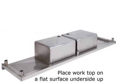
Place work top on a flat surface underside up