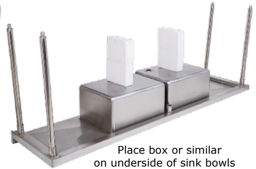
Place box or similar on underside of sink bowls