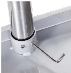
Tighten center set screws (2 per socket) DO NOT OVER TIGHTEN