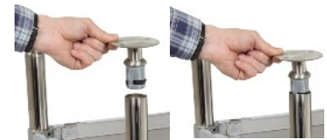
Flanged feet slide into leg secured by clip