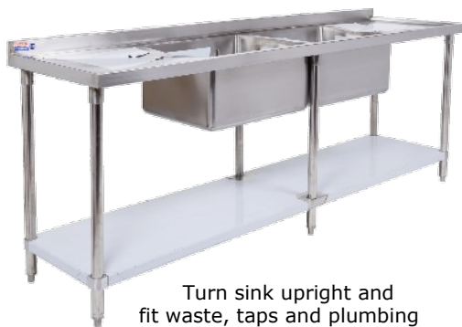
Turn sink upright and fit waste, taps and plumbing

For clear-under models assemble optional tie bar, place and fix as shelf above