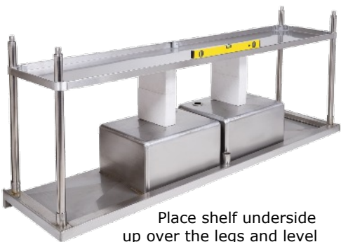
Place shelf underside up over the legs and level