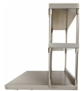
SSTU512 FITTED TO SSWB530-TU WALL BENCH