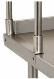
SHELF HOUSING FITTED TO WALL BENCH