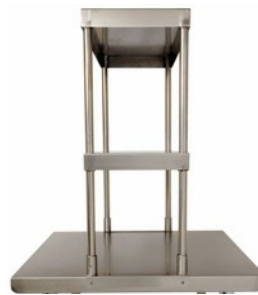
SSTP312 FITTED TO SSCT330-TP CENTER TABLE