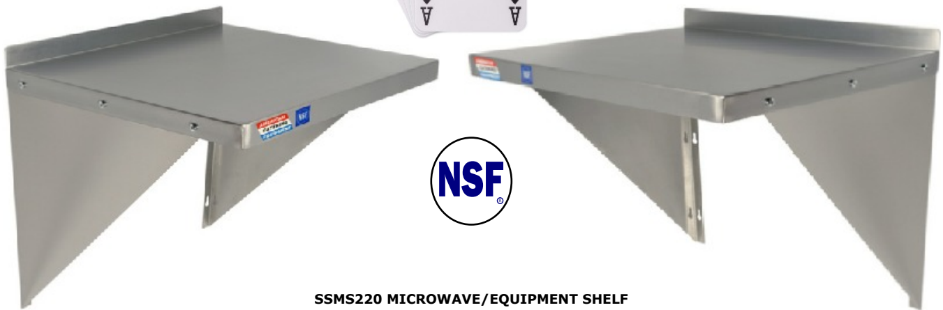
SSMS220 MICROWAVE/EQUIPMENT SHELF

Heavy duty quality, robust construction, good aesthetic style, safety finish is easy to maintain and keep clean. Suitable for any harsh hard working environment where high standard of hygiene is essential.